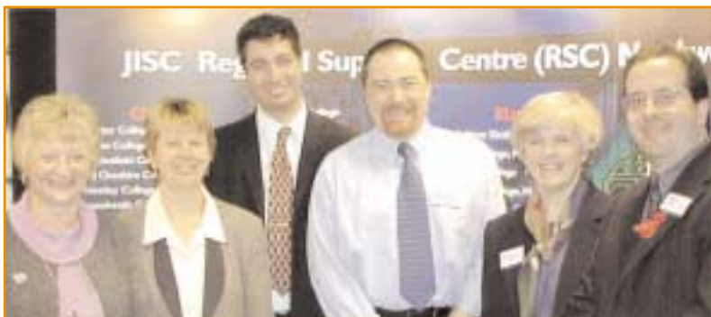
JISC Innovative Initiatives in Action, St Helens College 27th November 2001