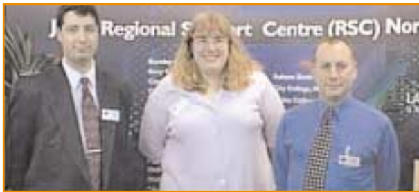
The original RSC NW team - December 2000