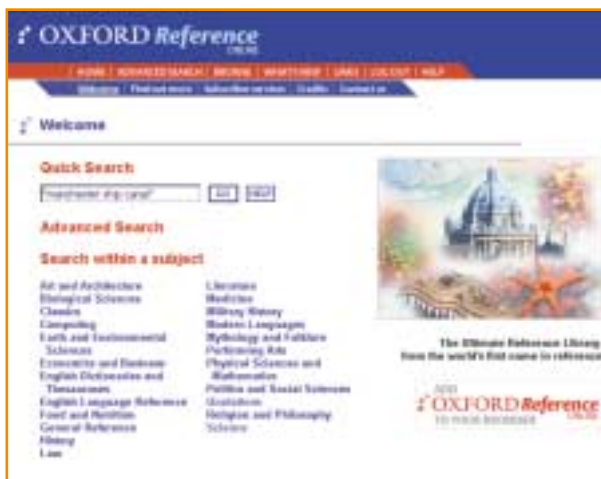
Screenshot from Oxford Reference Online