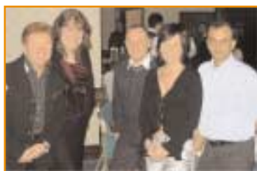
Some of the RSC NW team at the RSC UK Conference in Birmingham, March 2003