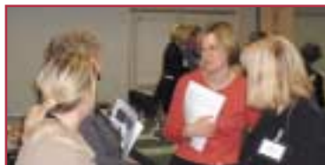
Delegates at the Exploiting Opportunities: Managing and Promoting JISC Collections event