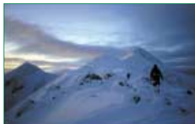
'Sgurr Fhuaran'