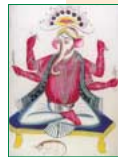
© SCRAN / National Museums of Scotland 'Ganesha'

One of the most exciting and extensive collections of digital resources for Further Education is SCRAN. For the last five years, SCRAN has been collecting digital materials from cultural organisations such as museums, galleries, media organisations, special collections and archives. The result is that over one million high quality images, sound files, video clips and text records are now available for download from the SCRAN website at www.scran.ac.uk . These cover a huge range of subjects; expect to find everything from images of ancient stone circles, medieval African sculpture and Art Nouveau jewellery, to interactive mountain panorama, rare poetry recordings and video clips from the zoo.