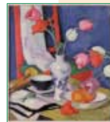
© SCRAN / Bridgeman Art Library 'Tulips & Fruit'