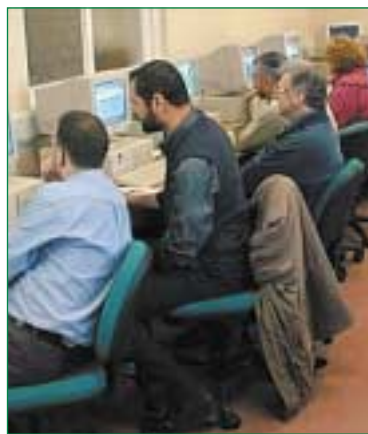
Delegates at Crafting the Content II

JISC RSC Northwest, Blackpool and The Fylde College, Ashfield Road, Bispham, Blackpool, FY2 0HB Tel: 01253 504070 Fax: 01253 504072 email: support@rsc-northwest.ac.uk www.rsc-northwest.ac.uk