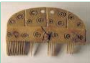
'Antler Comb'